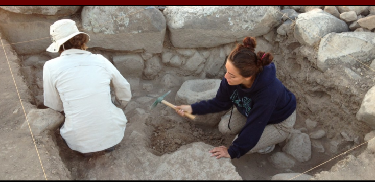
Interested in joining the Balu'a team in Jordan? Here is the information you need to know!