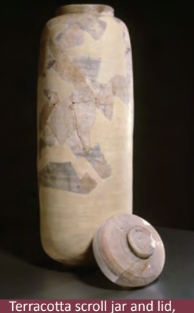
1st c. B.C.-1st c. A.D. Walters Art Museum, 48.2058

inside. Their tight-fitting lids, firmly in place, provided the perfect environment for preservation, protecting the scrolls from the elements--especially rodents, insects, molds, etc.--and subsequently making possible their extraordinary discovery. (Dimensions taken from the MET.)