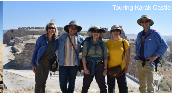
Touring Karak Castle