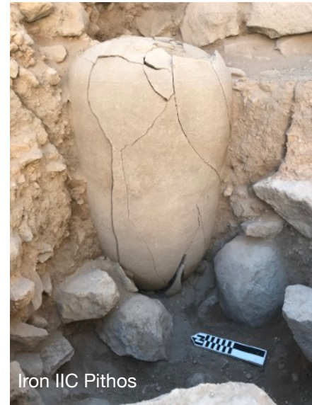
Iron IIC Pithos

This week and next our efforts will be focused on dating and then clearing the remaining Iron II wall that stands in the probe. With a little luck, we will begin removing that wall early next week, at which point we will have to come up with a process for getting the rather large stones up out of the probe which is now nearly 2 m deep.