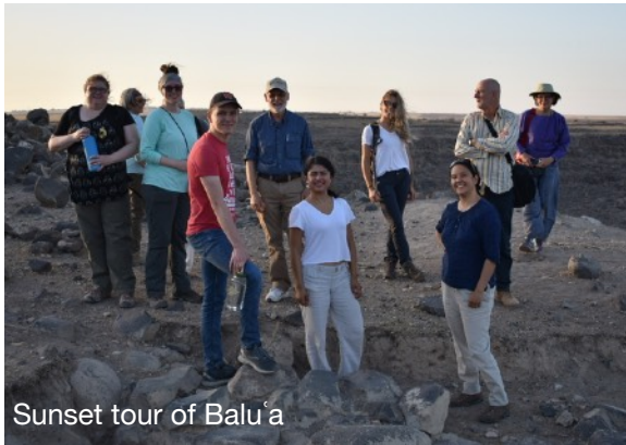
Sunset tour of Balu'a