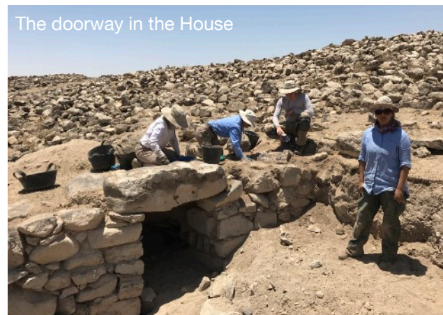
The doorway in the House

Before we began excavations in the domestic area (House A) of Khirbat al-Balu'a we noted that the 2017 excavations has been disturbed by a robber's trench. At the end of the 2017 season, a large and intact door lintel was discovered, but was unfortunately located along the western balk, and so the open doorway beneath was left intact and closed. This proved to be too appealing, due to its similar appearance to the opening of a built stone tomb. A large amount of earth inside the door was disturbed, revealing only a stone rubble layer beyond, which likely dampened our robbers' enthusiasm. They also excavated through our